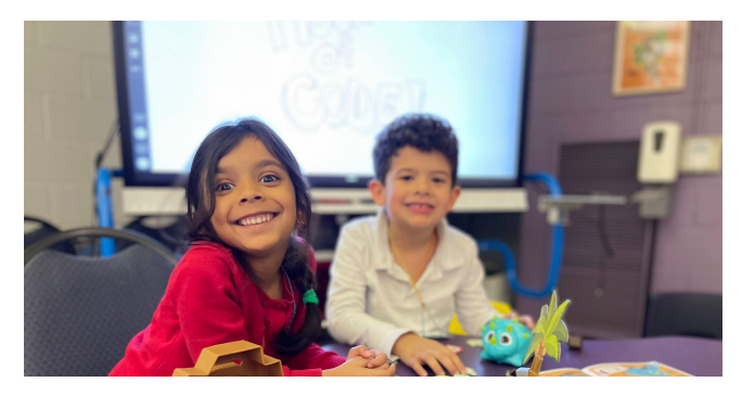
Kindergarteners taking part in "Hour of Code"

Moffet's philosophy is based on a commitment to provide our students with a safe, secure environment that supports high expectations of teaching and learning for all children.