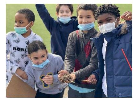
4th Graders Engaged in a Watershed Audit of Moffet

FaceBook, Instagram, & LinkedIn @johnmoffetelementary #MoffetPride