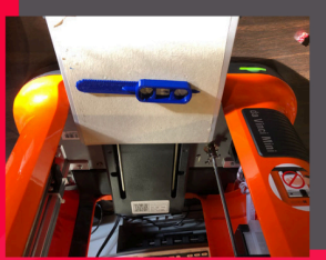
3D PRINTING & DESIGN THINKING